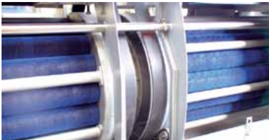
Transition drum allowing efficient produce flow between barrels