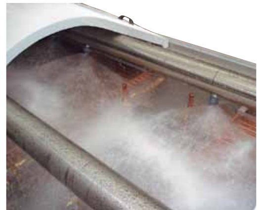
Water spray over refrigerated coils