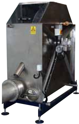
Rotary filter system

* Custom models also available ** Optional