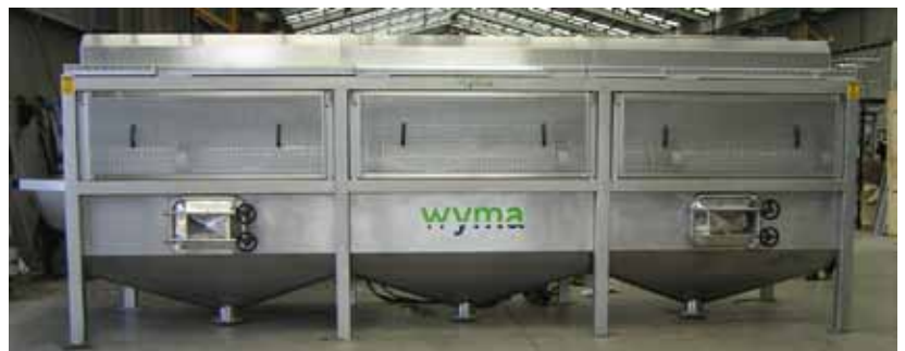
Six metre stainless steel Wyma Barrel Washer with out-feed scoops

The Barrel Washer offers either out-feed scoops or a submerged out-feed elevator* to ensure that produce is handled gently when exiting the Barrel Washer. For optimum results the Barrel Washer is usually followed in a processing line by a Wyma Vege-Polisher.