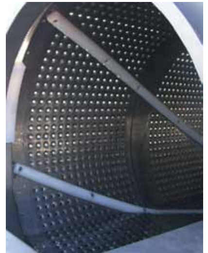
Interior Perforated Drum with Agitation Bars