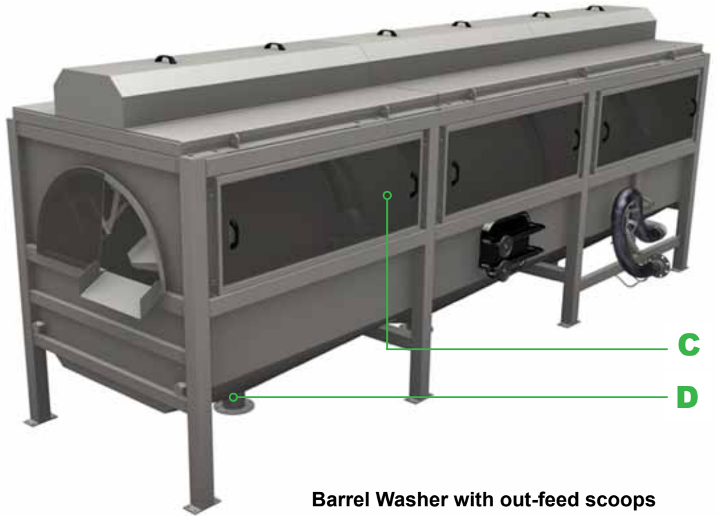
Barrel Washer with out-feed scoops